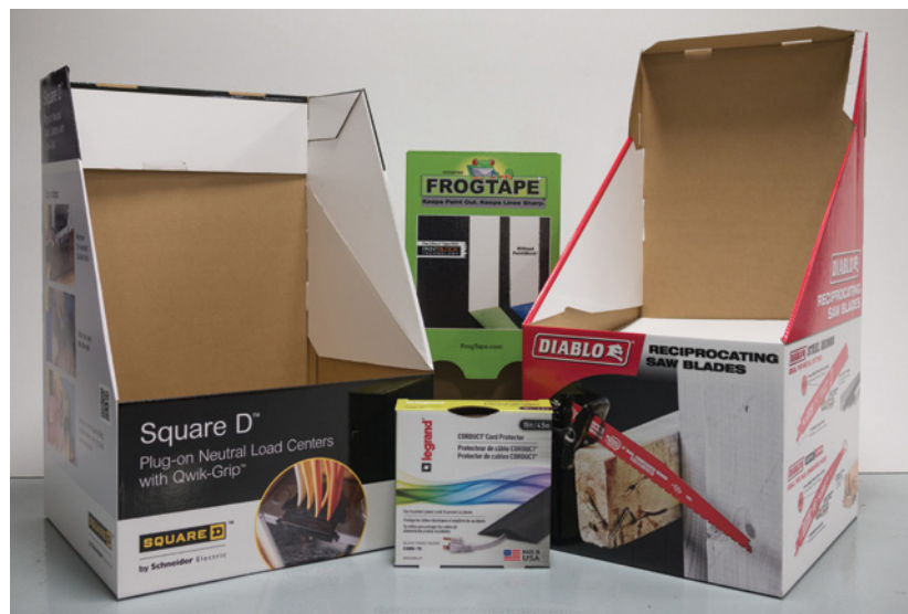
Complete Design & Packaging's shift to digital is exemplified in its capabilities for clients.